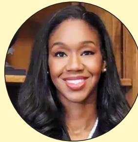
Kyra Harris Bolden* Supreme Court Justice