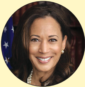
Kamala D. Harris President United States