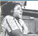
Fannie Lou Hamer 1917-1977

Fannie Lou Hamer worked tirelessly and yielded up her life to support social, economic and political issues that impacted African Americans from Mississippi to Michigan. This Political Action Committee maintains that same tradition of activism and dedication. We are committed to supporting candidates for federal, state and local offices who have evidenced a constructive progressive position on key issues. These issues impact our community without regard to race, religion, sex or creed.