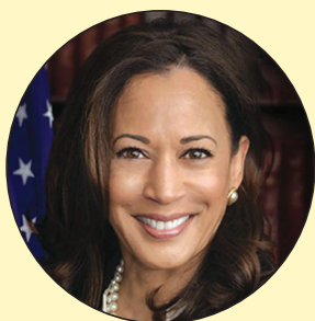
Kamala D. Harris President United States