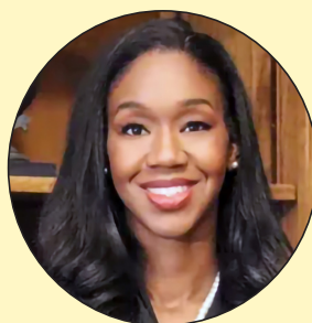
Kyra Harris Bolden* Supreme Court Justice