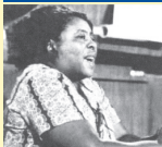
Fannie Lou Hamer 1917-1977

Fannie Lou Hamer worked tirelessly and yielded up her life to support social, economic and political issues that impacted African Americans from Mississippi to Michigan. This Political Action Committee maintains that same tradition of activism and dedication. We are committed to supporting candidates for federal, state and local offices who have evidenced a constructive progressive position on key issues. These issues impact our community without regard to race, religion, sex or creed.