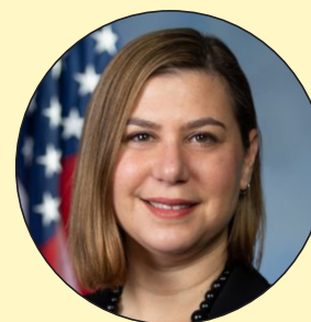
Elissa Slotkin U.S. Senator