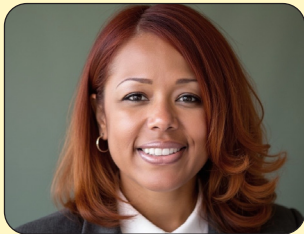
ANGELIQUE PETERSON-MAYBERRY* WAYNE COUNTY COMMISSIONER DISTRICT 5