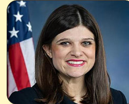
HALEY STEVENS For U.S. SENATE