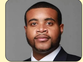
DONAVAN MCKINNEY For U.S. CONGRESS - 13 TH DISTRICT