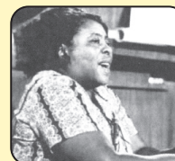
Fannie Lou Hamer 1917-1977

Fannie Lou Hamer worked tirelessly and yielded up her life to support social, economic and political issues that impacted African Americans from Mississippi to Michigan. This Political Action Committee maintains that same tradition of activism and dedication. We are committed to supporting candidates for federal, state and local offices who have evidenced a constructive progressive position on key issues. These issues impact our community without regard to race, religion, sex or creed.